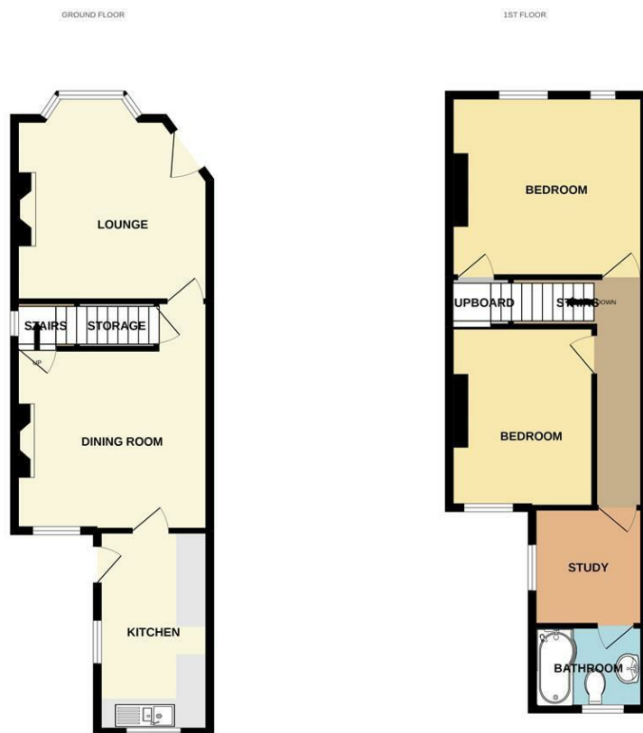
16 PARK STREET, LONG EATON

Whilst every attempt has been made to ensure the accuracy of the floorplan contained herein, measurements of doors, windows, rooms and any other items are approximate and no responsibility is taken for any error, omission or misstatement. This plan is for illustrative purposes only and should be used as such by any prospective purchaser. The services, systems and appliances shown have not been tested and no guarantee as to their operability or efficiency can be given. Made with Metropix 6/2022